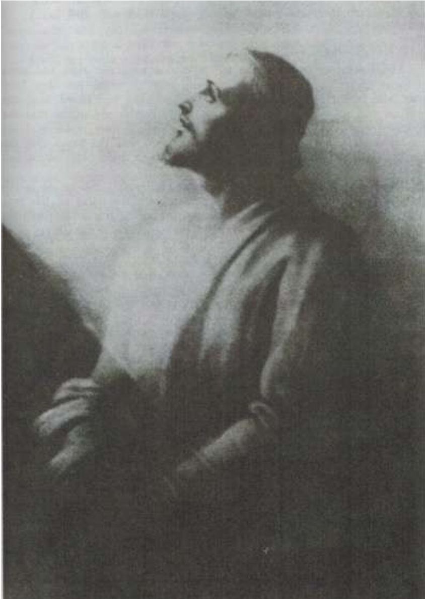
Ascension of Jesus the Christ greeted by Celestial Spirits called angels.