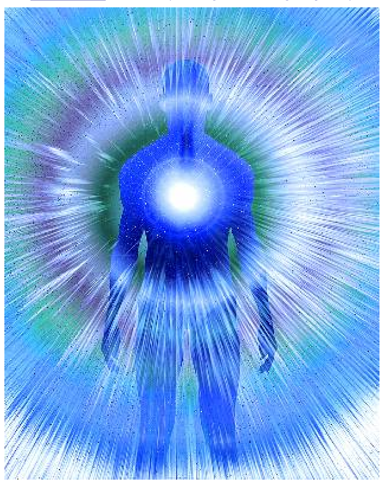
LOVE and LIGHT: The luminosity of a loving soul shines through the spirit body.