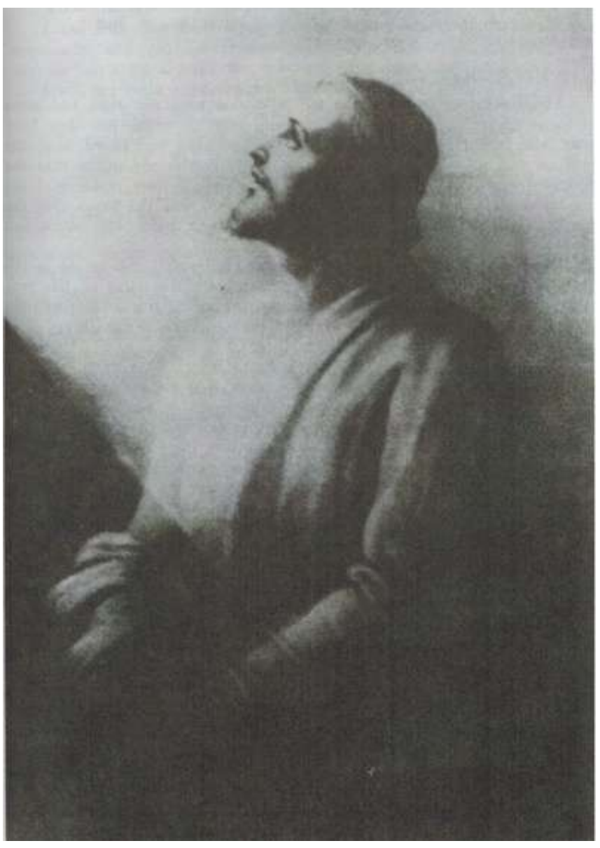
\label{eq:Ascension of Jesus the Christ greeted by Celestial Spirits called angels. \\