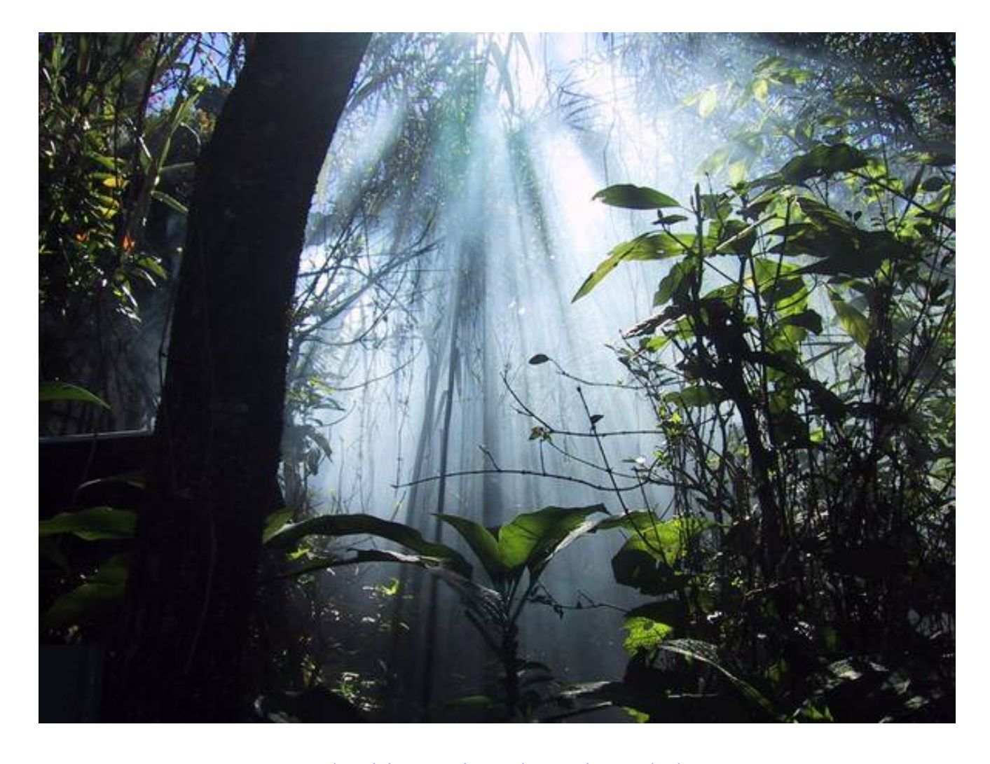
"Peace And Spirit Creating Alternative Solutions"

PASCAS FOUNDATION (Aust) Ltd ABN 23 133 271 593