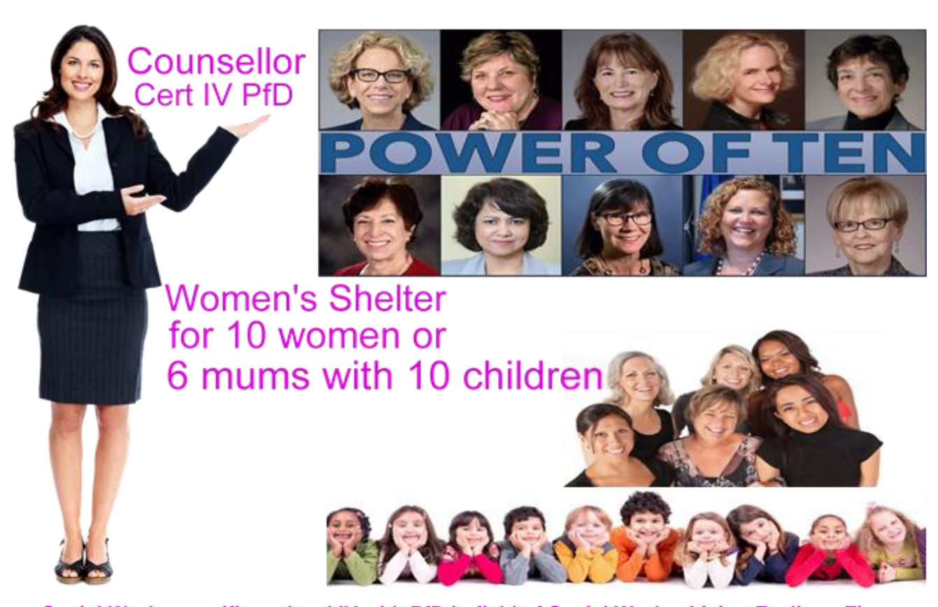
Social Worker certificate level IV with PfD in field of Social Work – Living Feelings First